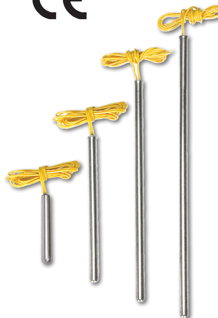
Replacement Probes 1.75", 4.5", 6.5" & 8.25" Probes with Etched Teflon Leads (The 1.75" Probe is "No Flare" while the other three are "Flared")

*All Passive Thermistors 20KΩ and smaller are CE compliant.